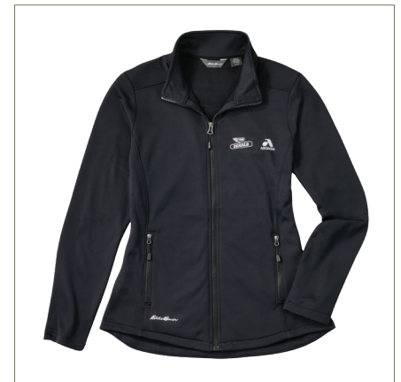
5F | NEW Ladies Eddie Bauer® Jacket 7.4 oz., 100% Recycled polyester fleece. Open cuffs and open drop tail hem. Contrast Eddie Bauer® heat transfer logo on right hem. Import. Embroidery.