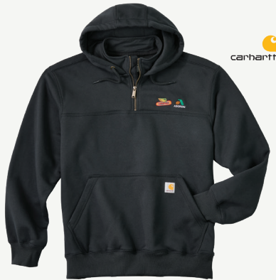
5B | NEW Carhartt® Zip Hoodie 13 oz., 75/25 Cotton/poly blend with Rain Defender® durable water-repellent finish. Carhartt® label sewn on hand warmer pocket. Import. Embroidery.