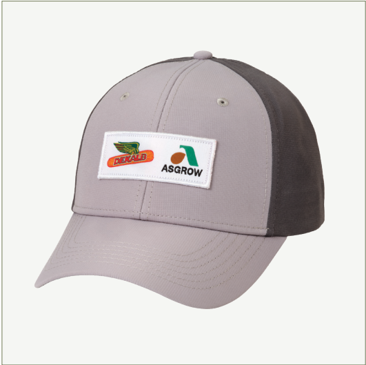
3A | Polyester Ripstop Cap 100% polyester ripstop. Fabric strap with hook-and-loop closure. Low profile, structured. Import. Woven Label. Grey 459038 1-23 24-287 288-599 600+ 7.20 6.90 6.55 6.35