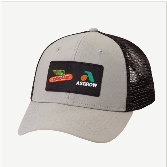
3C | Cotton Ripstop Cap 100% cotton ripstop with soft polyester mesh sides and back. Plastic snap closure. Low profile, structured. Import. Woven Label. Grey 459040 1-23 24-287 288-599 600+ 7.20 6.90 6.70 6.55