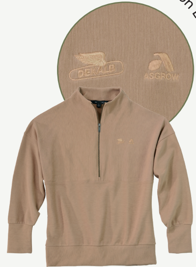
5C | NEW Ladies MERCER+METTLE™ Texture 1/4 Zip 9.7 oz., 55/42/3 Cotton/polyester/spandex ottoman knit. Odor-fighting. Slightly boxy fit. Import. Embroidery.