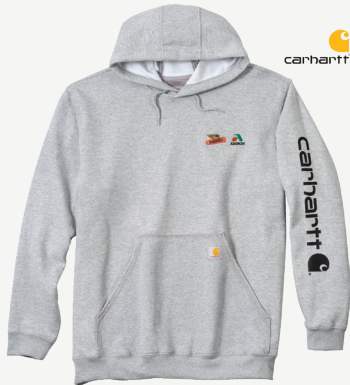
5A | Carhartt® Midweight Hoodie 10.5-ounce, 70/30 cotton/poly blend. Import. Embroidery.