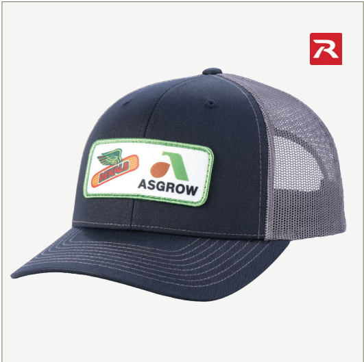
3B | NEW Richardson® Trucker Cap 60% Cotton/40% polyester with polyester trucker mesh sides and back. Cotton sweatband. Plastic snap closure. Mid profile, structured. Import. Sublimated Patch. Navy/Charcoal 480394 1-23 24-287 288-599 600+ 16.55 16.10 15.65 15.25