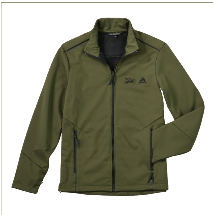
5D | NEW Tech Soft Shell Jacket 100% Polyester knit shell with DWR finish bonded to water-resistant film insert. 100% Polyester brushed grid-texture, microfleece lining. Import. Embroidery.