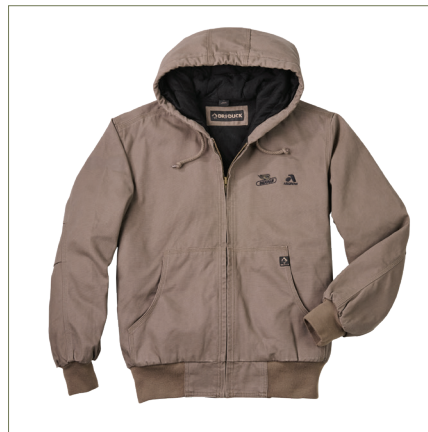
5E | NEW DRI DUCK® Cheyenne Jacket 12 oz. Quarry-washed canvas. Diamond-quilted, brushed tricot-lined body and hood. Import. Embroidery.