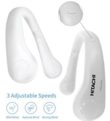
Item 4 Bladeless Neck Fan Minimum – 25 pieces $20.45 per piece