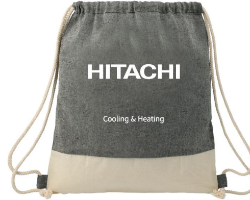
Item 3 Drawstring Bag Minimum – 150 pieces $4.25 per piece