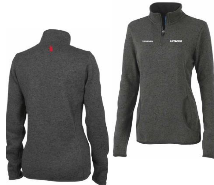
Item 8 Ladies Heathered Fleece Pullover Minimum – 1 piece $90.60 per piece Available sizes XS – 3XL