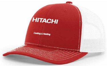
Item 9 Richardson Snapback Trucker cap Red/White Minimum – 12 pieces $17.90 each at 12 qty $16.50 each at 24 qty