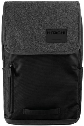
Item 1 Barrow Pack Minimum – 1 piece $90.60 per piece