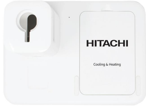
Item 2 Docksy Minimum – 1 piece $88.25 per piece