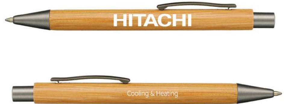
Item 6 Bamboo Quick Dry Gel Ballpoint Minimum – 288 pieces $3.35 per piece