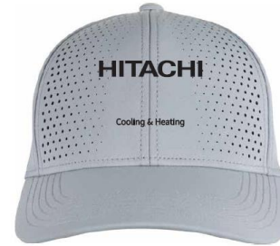
Item 11 The Airflow Cap Minimum – 12 pieces $25.15 each at 12 qty $23.75 each at 24 qty