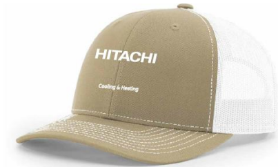
Item 10 Richardson Snapback Trucker cap Khaki/White Minimum – 12 pieces $17.90 each at 12 qty $16.50 each at 24 qty