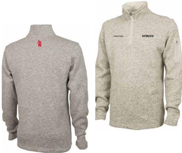
Item 7 Men's Heathered Fleece Pullover Minimum – 1 piece $90.60 per piece Available sizes XS – 3XL