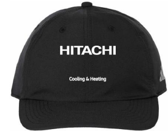
Item 12 Adidas Performance Max Cap Minimum – 12 pieces $28.80 each at 12 qty $27.30 each at 24 qty