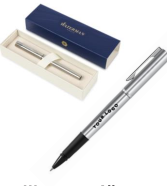
Waterman Allure Rollerball Pen MIN 15 | $27.16

From welcome kits that provide the comforts of home, to premium room drops that will surprise and delight, reward your top performers with memorable gifts that will amplify their incentive experiences.