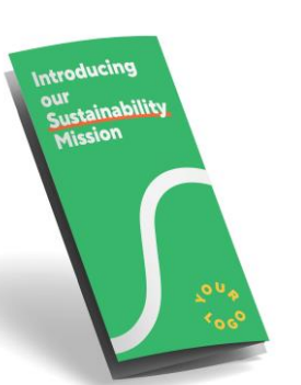
Recycled Tri-Fold Eco-Brochure, 8.5" x 11" MIN 250 | $1.22