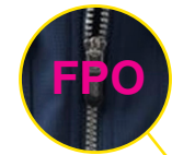
Custom zipper pulls

We provide custom, special order ideation that adheres to Michelin's Brand Standards. Please reach out to jackie.abel@staples.com or 702.467.7144 to specify the type of product, quantity, date and budget you need. We will work directly with you on custom options and provide samples, proofs and BDF pre-approval letters to ensure you receive the quality product you're looking for.