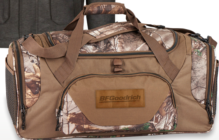
Custom embossed patch