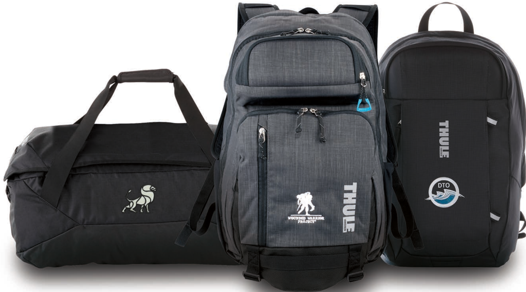
9020-45 Thule® GoPack 28" Cargo Duffel As Low As: $74.98 [E]

Built for the true outdoor active lifestyle, these bags are made to last. Whether it's a bike ride, long hike or weekend adventure, these outdoor bags are up to the challenge.