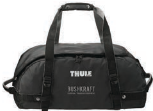
9020-42 Thule® Chasm 40L Duffel As Low As: $134.98 [E]