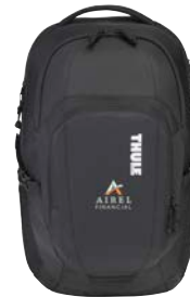
9020-35 Thule® Narrator 15" Computer Backpack As Low As: $104.98 [E]