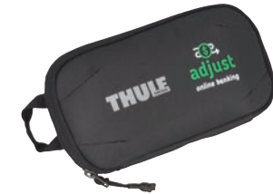
9020-72 Thule® Subterra PowerShuttle Mini As Low As: $29.98 [E]