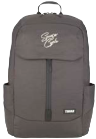
9020-22 Thule® Lithos 15" Computer Backpack 20 L As Low As: $79.98 [E]