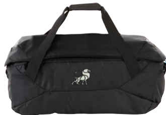
9020-45 Thule® GoPack 28" Cargo Duffel As Low As: $74.98 [E]