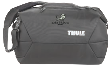
9020-70 Thule® Subterra 45L Duffel As Low As: $159.98 [E]