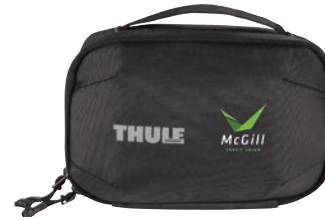
9020-71 Thule® Subterra PowerShuttle As Low As: $34.98 [E]