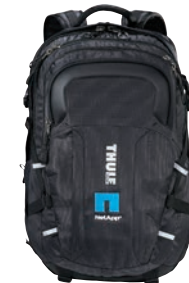
9020-11 Thule® EnRoute Escort 2 15" Laptop Backpack As Low As: $119.98 [E]