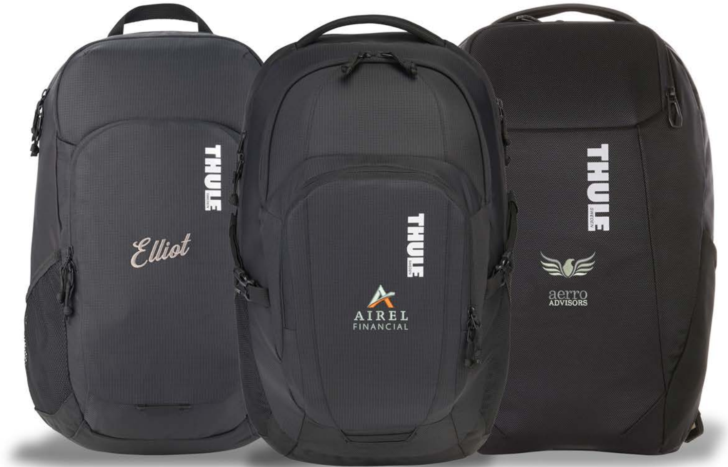
9020-39 Thule® Achiever 15" Computer Backpack As Low As: $79.98 [E]

Whether you're traveling for work or extending your trip to explore a new city, it's nice to have a bag that can do both. Our Business Leisure bags safely carry everything you need for work – or play.