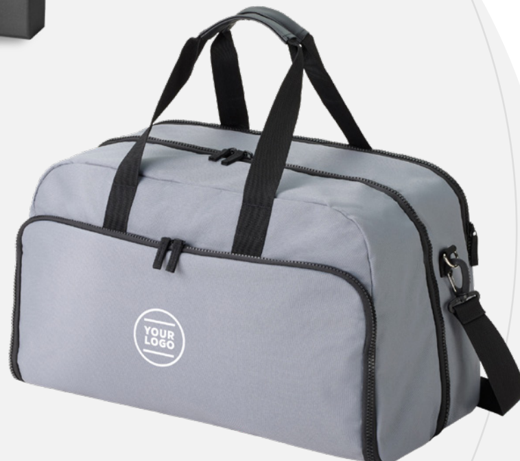
Workation Weekender Duffel