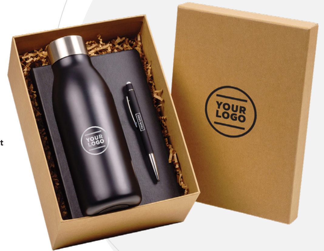
Desk Essentials Set