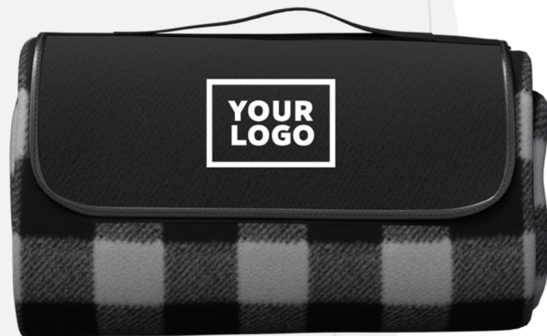
Weekend Leisure Set $37.99 Min: 25