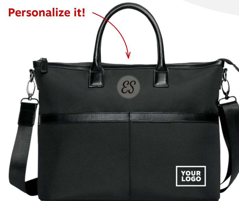
Personalized Classic Business Tote