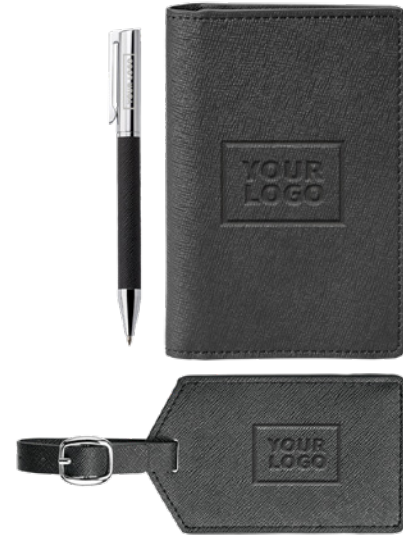
The Weekender Travel Kit $128.99 Min: 8