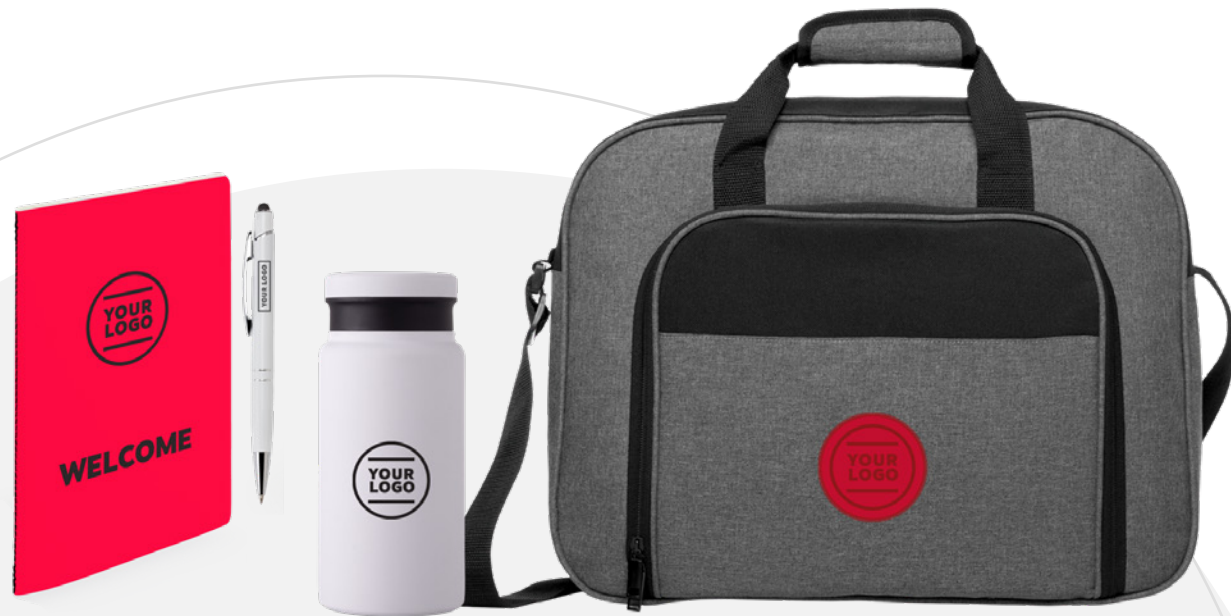
New Hire Welcome Set

Welcome new hires and empower your workplace's potential. Customized merchandise and kits designed to reinforce important messaging and create connection to your organization allow you to promote continuous growth and learning for every team member, whether it's their first day or their one hundredth.