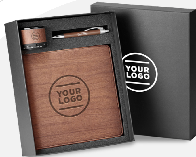
Desktop Gift Set