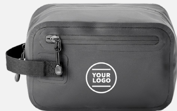
Water Resistant Accessory Case