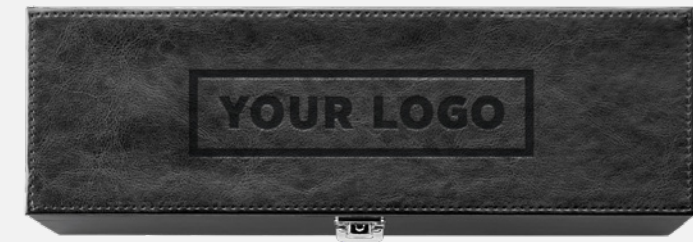
Wine Accessories Box $42.99 Min: 20