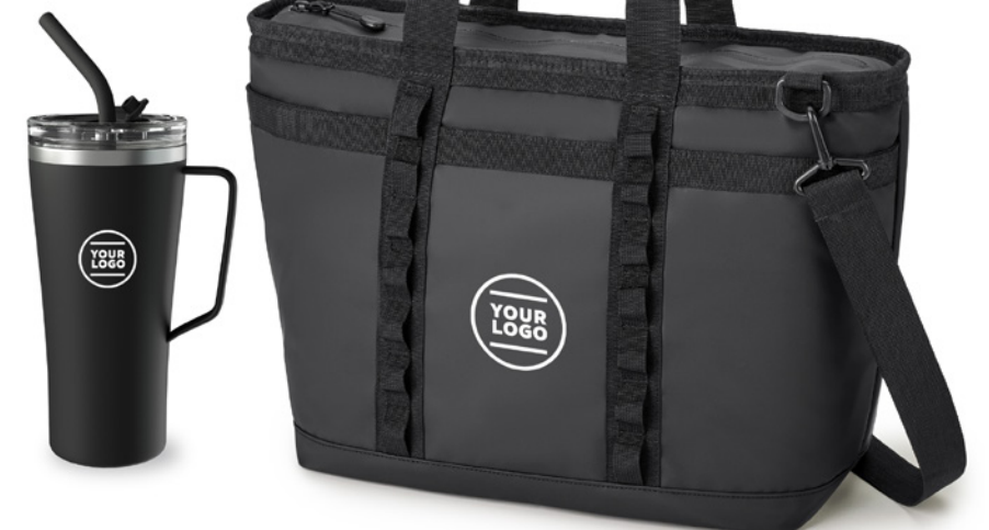
Market Ready Cooler Tote & Tumbler Bundle $108.99 Min: 8