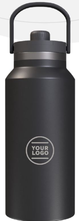
Big Swig Pro-Grade Stainless Steel Bottle, 42oz