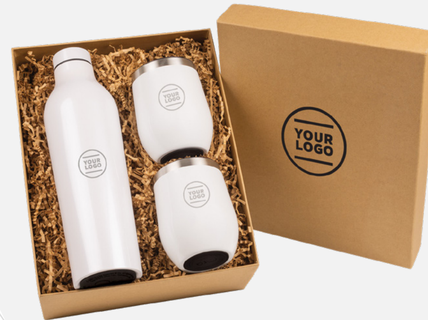
Sip & Unwind Kit