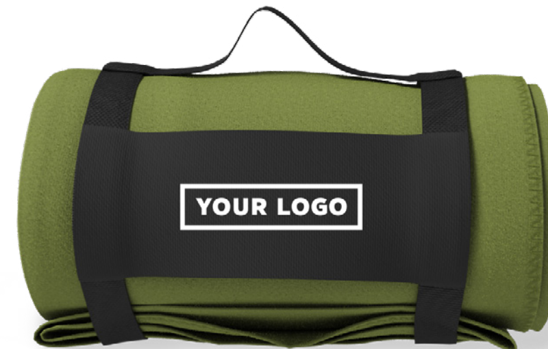
Dakota Fleece Blanket