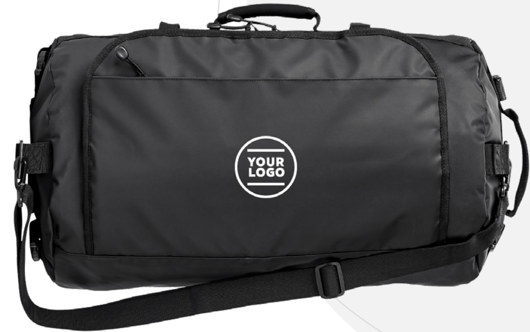
Call of the Wild Water Resistant Duffle Backpack