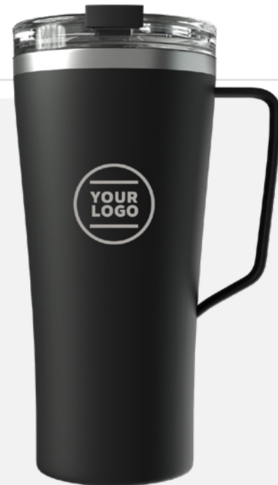
All-Day Adventure Stainless Steel Travel Mug, 32oz