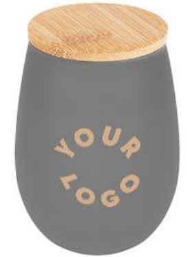
Center Piece Scented Candle Style #85013