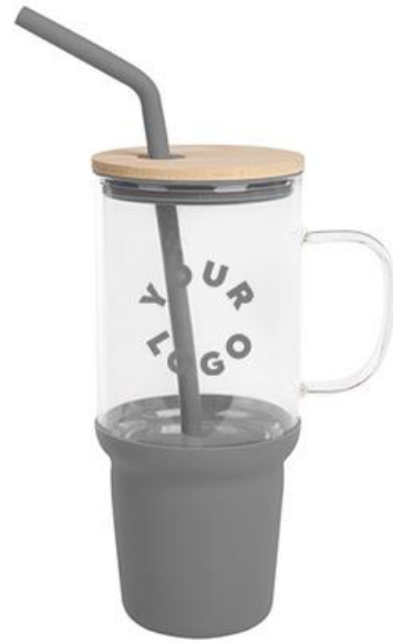
32oz. Evelyn Glass Tumbler with Handle Style #50079

Support employee financial goals and reward them along the way.