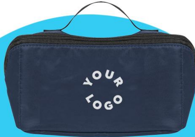
Trendsetter Toiletry Bag Style #30092