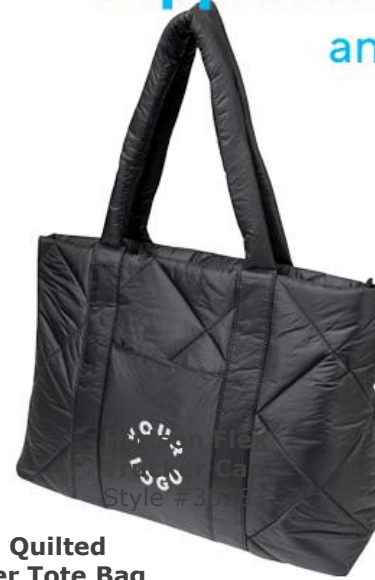
Luxe Quilted Puffer Tote Bag Style #30102