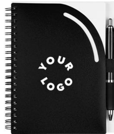
Curvy Top Notebook Set Style #MP3533