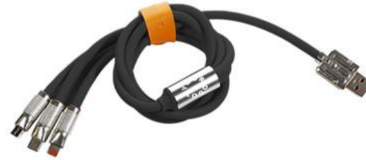
Heavy Duty 3-in-1 Charging Cable Style #ED018wht