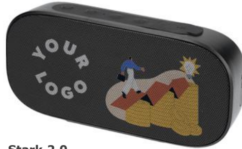
Stark 2.0 Bluetooth Speaker Style #7197-40

Increase participation and encourage associates to utilize financial wellness resources.