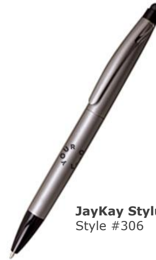
JayKay Stylus Pen Style #306