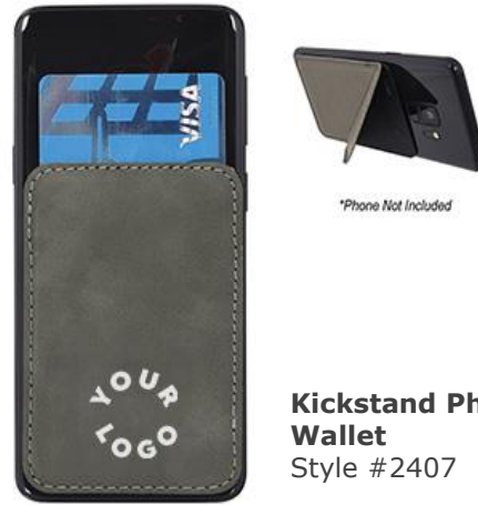
Kickstand Phone Wallet Style #2407