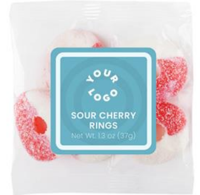
Sour Cherry Rings Style #BB446BG