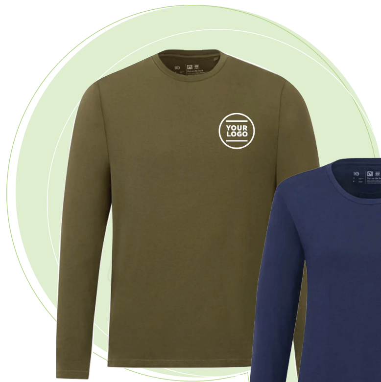
tentree Organic Cotton Long Sleeve T-Shirt Cradle to Cradle Certified™ Gold, which means it can go safely back to the earth once you're finished loving it.