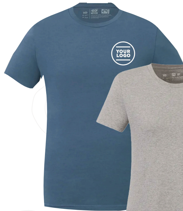
tentree Organic Cotton Short Sleeve T-Shirt Stay comfy all day with a classic tee made with Fairtrade certified 100% organic cotton.