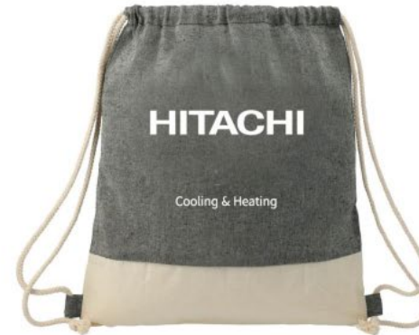
Item 3 Drawstring Bag Minimum – 150 pieces $4.15 per piece