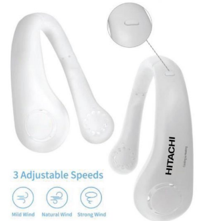
Item 6 Bladeless Neck Fan Minimum – 25 pieces $19.45 per piece