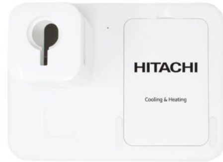
Item 2 Docksy Minimum – 1 piece $45.25 per piece