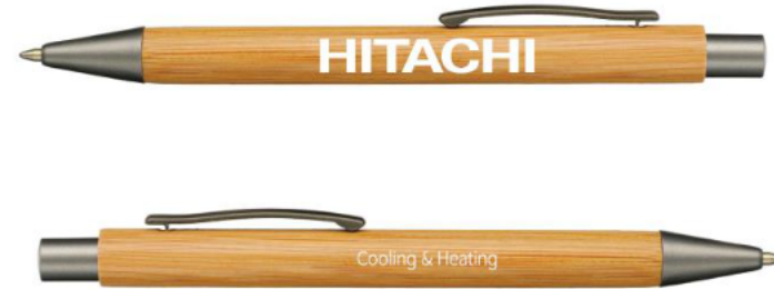
Item 5 Bamboo Quick Dry Gel Ballpoint Minimum – 288 pieces $3.25 per piece