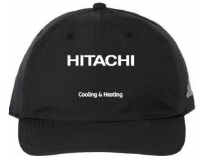
Item 12 Adidas Performance Max Cap Minimum – 12 pieces $26.95 each at 12 qty $25.70 each at 24 qty