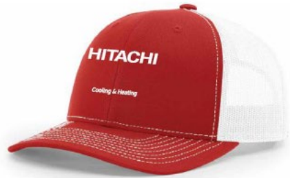
Item 9 Richardson Snapback Trucker cap Red/White Minimum – 12 pieces $14.75 each at 12 qty $13.50 each at 24 qty