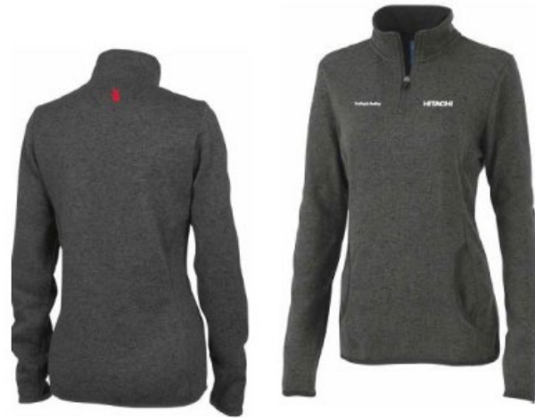
Item 8 Ladies Heathered Fleece Pullover Minimum – 1 piece $74.50 per piece Available sizes XS – 3XL