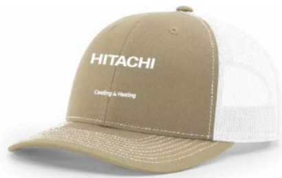
Item 10 Richardson Snapback Trucker cap Khaki/White Minimum – 12 pieces $14.75 each at 12 qty $13.50 each at 24 qty