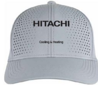
Item 11 The Airflow Cap Minimum – 12 pieces $21.25 each at 12 qty $20.10 each at 24 qty