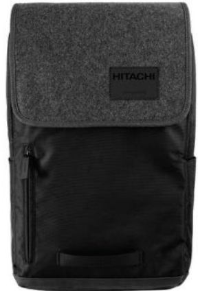
Item 1 Barrow Pack Minimum – 1 piece $49.30 per piece