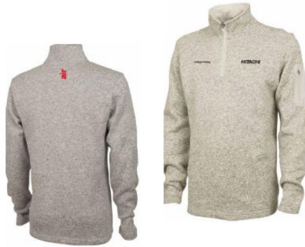
Item 7 Men's Heathered Fleece Pullover Minimum – 1 piece $74.50 per piece Available sizes XS – 3XL