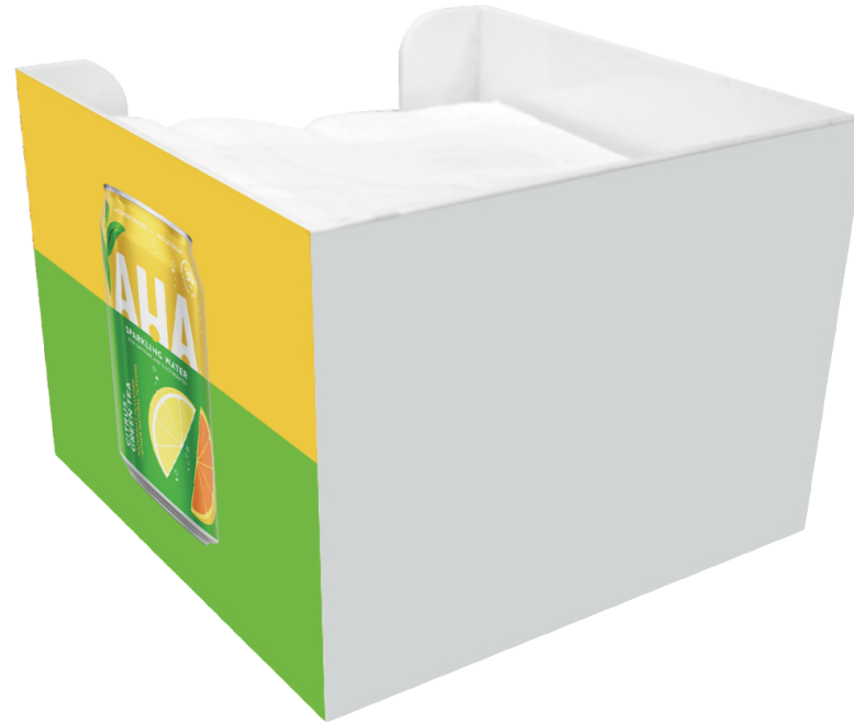
Left Side Only

Standard Production Time: 10-15 business days