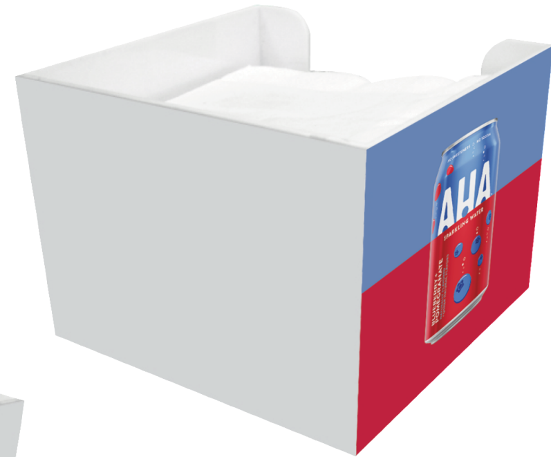
Right Side Only

As a note, final selections will have to meet Coke compliance and brand guidelines, so there is a small chance that we may have to find like items should the items you select have any testing issues (meaning flammability reports, lead in surface coatings, FDA for drinkware, etc. aren't available). Should there be any issues we will let you know. This may delay your order.