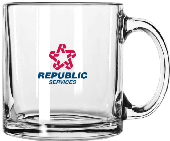
1605-14 Libbey 13 oz Glass Coffee Mug