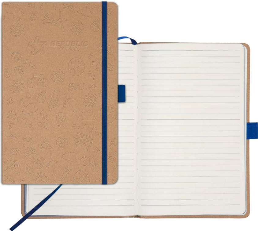
ECP-58- (5.5"x 8.5") Eco Color Pop Journal (Blue)