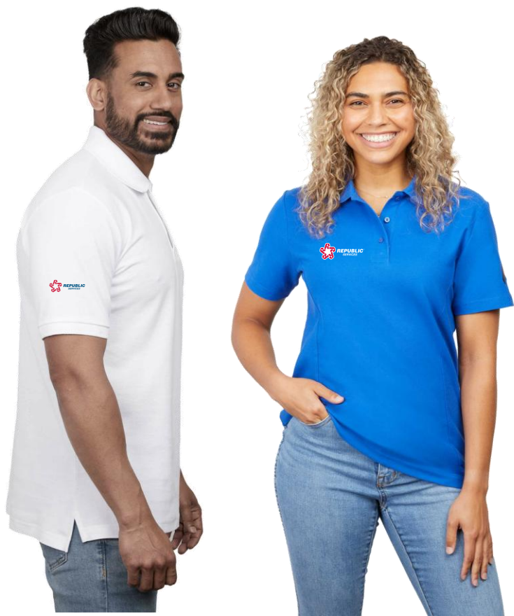
TM16648 / TM96648 Palo Short Sleeve 100% Cotton Pique Polo $21.50c