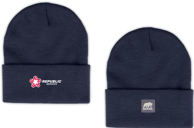
TM36115 BERNE Heritage Cuff Beanie $14.20e