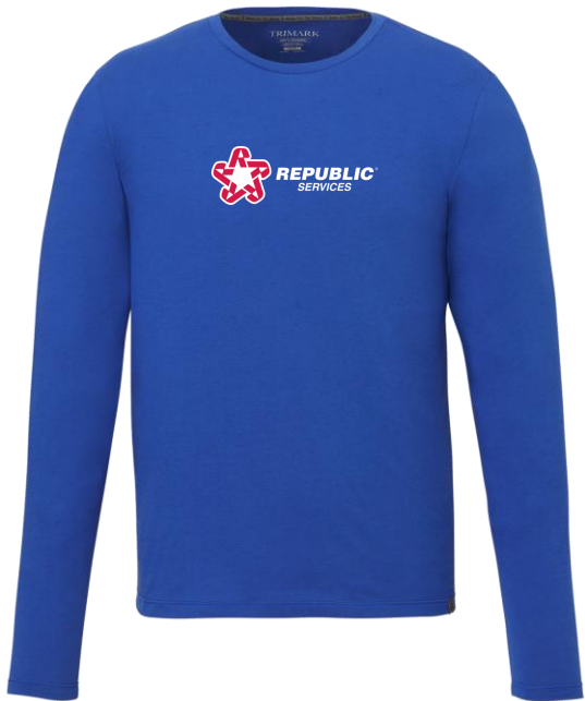
TM17874 / TM97874 Somoto Eco Long Sleeve Tee $27.00c