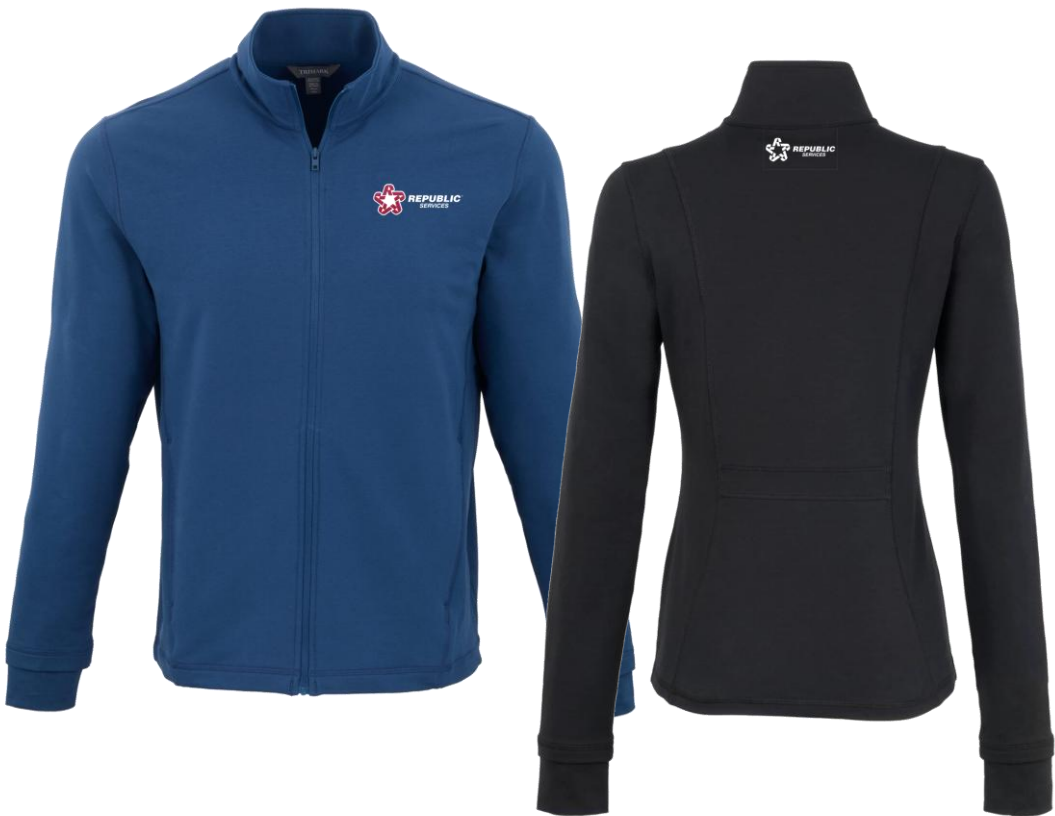
TM18735 / TM98735 Lyon Eco Stretch Full Zip Jacket $55.33c