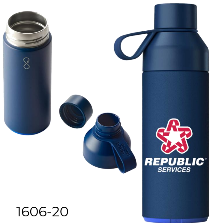
1606-20 Ocean Bottle Original 17 oz