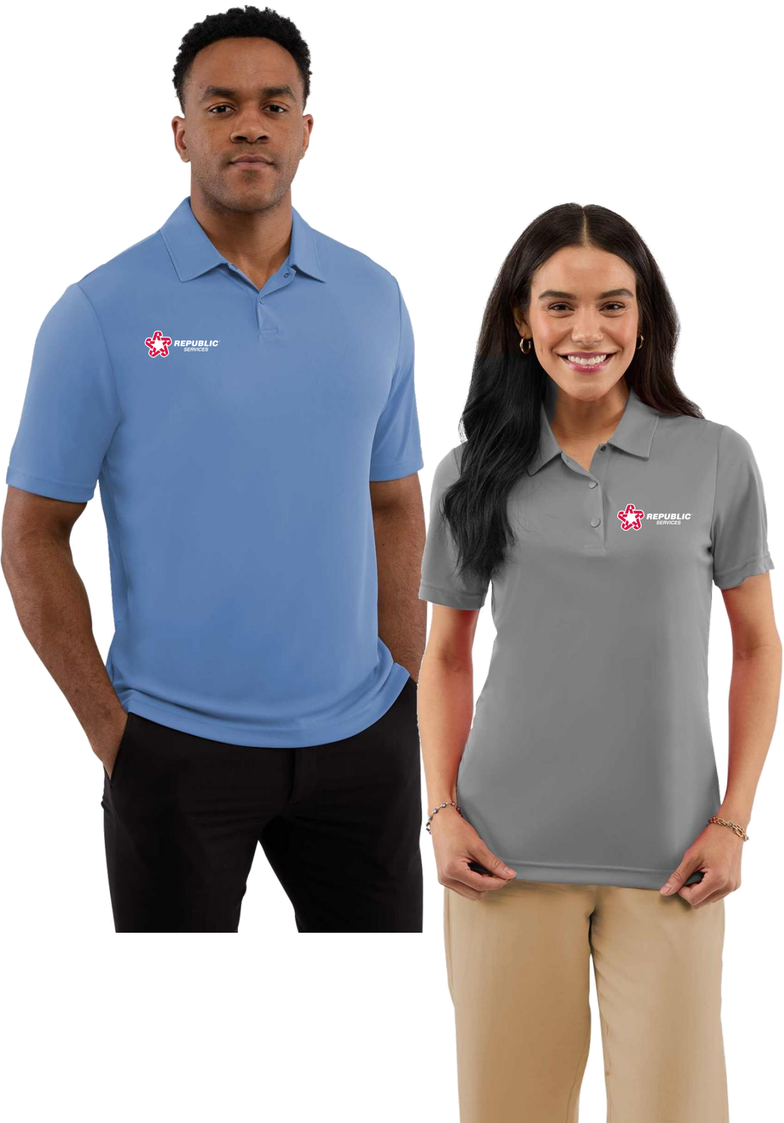
TM16317 / TM96317 Dara Recycled Tech Polo $28.67c