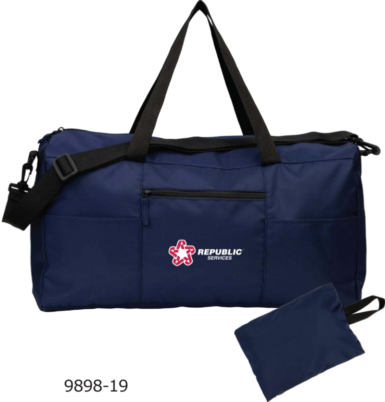
9898-19 Packable Recycled Duffel Bag $18.78c