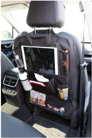
SM-9566 Recycled Back Seat Car Organizer w/ Table Pocket $14.98c