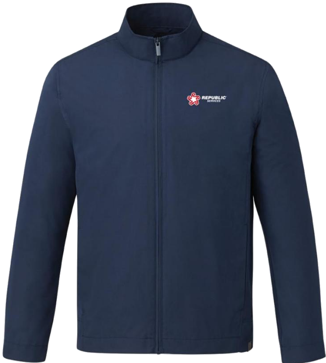
TM12726 / TM92726 Foster Eco Jacket $62.00c