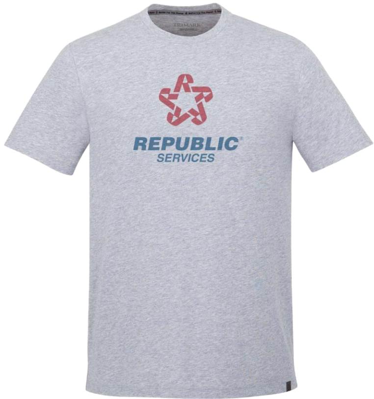
TM17873 / TM97873 Somoto Eco Short Sleeve Tee $21.50c