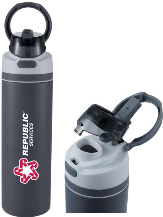
SM-6965 Elvin 28oz Recycled Stainless Flip Straw Bottle $11.65c