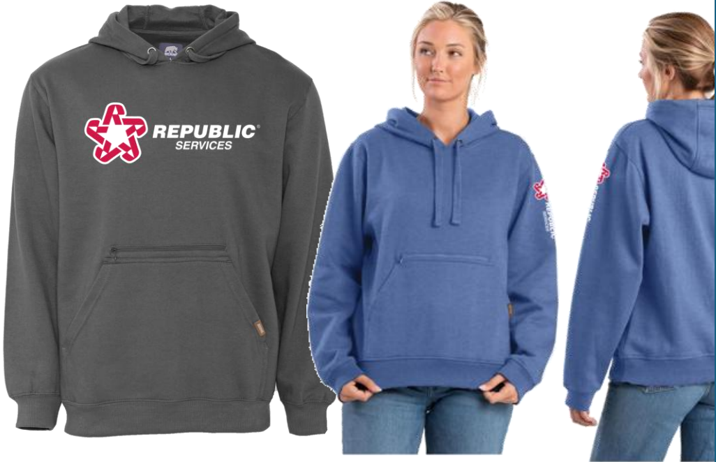
TM18237 / TM98237 BERNE Heritage Zippered Pocket Hooded Pullover Sweatshirt