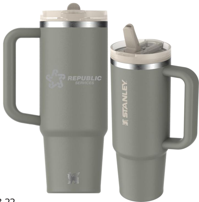
1603-22 Stanley Quencher ProTour Flip Straw Tumbler 30 oz $40.00e