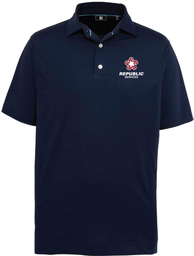
TM16320 FootJoy Tonal Dot Performance Polo $90.63d