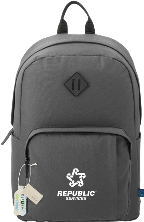
3900-01 Repreve® Ocean Everyday 15" Computer Backpack $30.98c