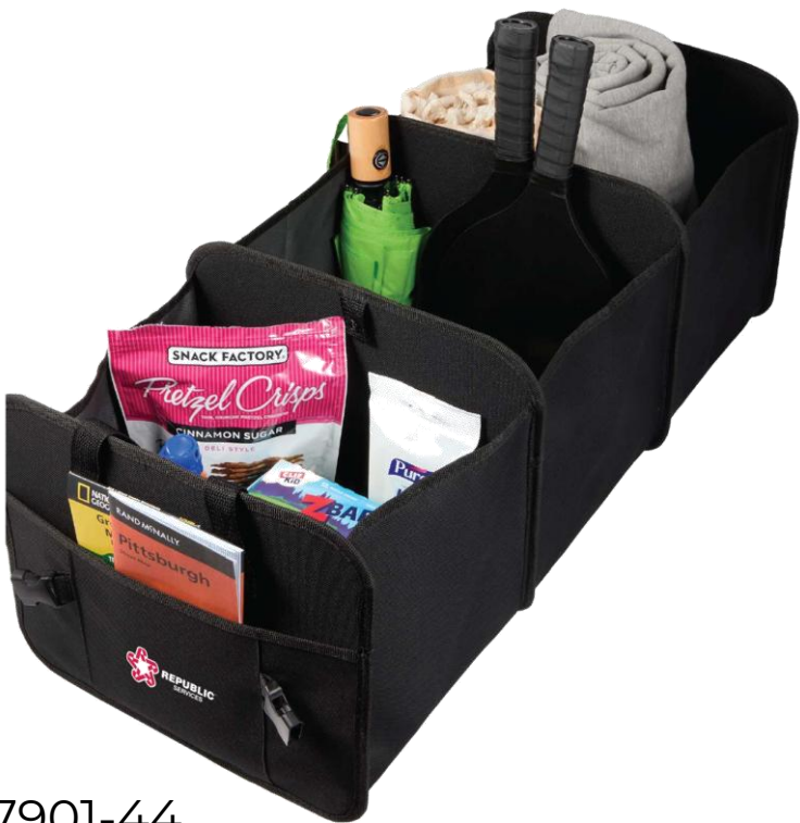
7901-44 Recycled 3-Compartment Trunk Organizer