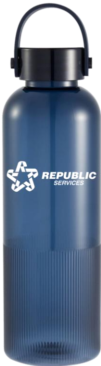
SM-6978 Prism 24 oz Recycled Plastic Sports Bottle