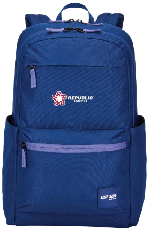
8151-64 Case Logic Uplink Recycled 16” Laptop Backpack