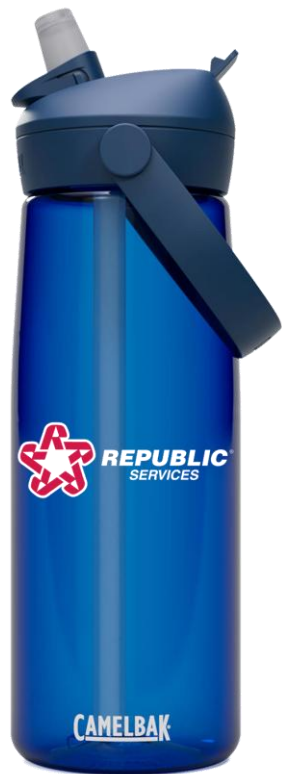
1627-90 CamelBak Thrive™ 25 oz Flip Straw Bottle with Tritan™ Renew $21.00e