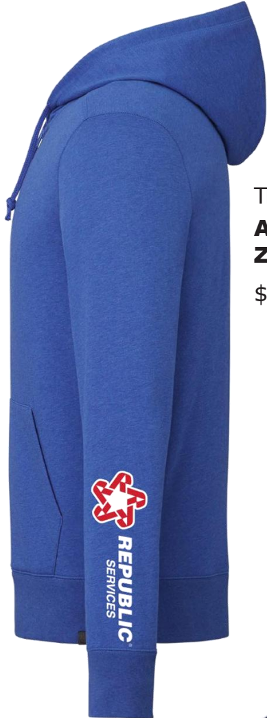
TM18223 / TM98223 Argus Eco Fleece Full Zip Hoody $55.33c