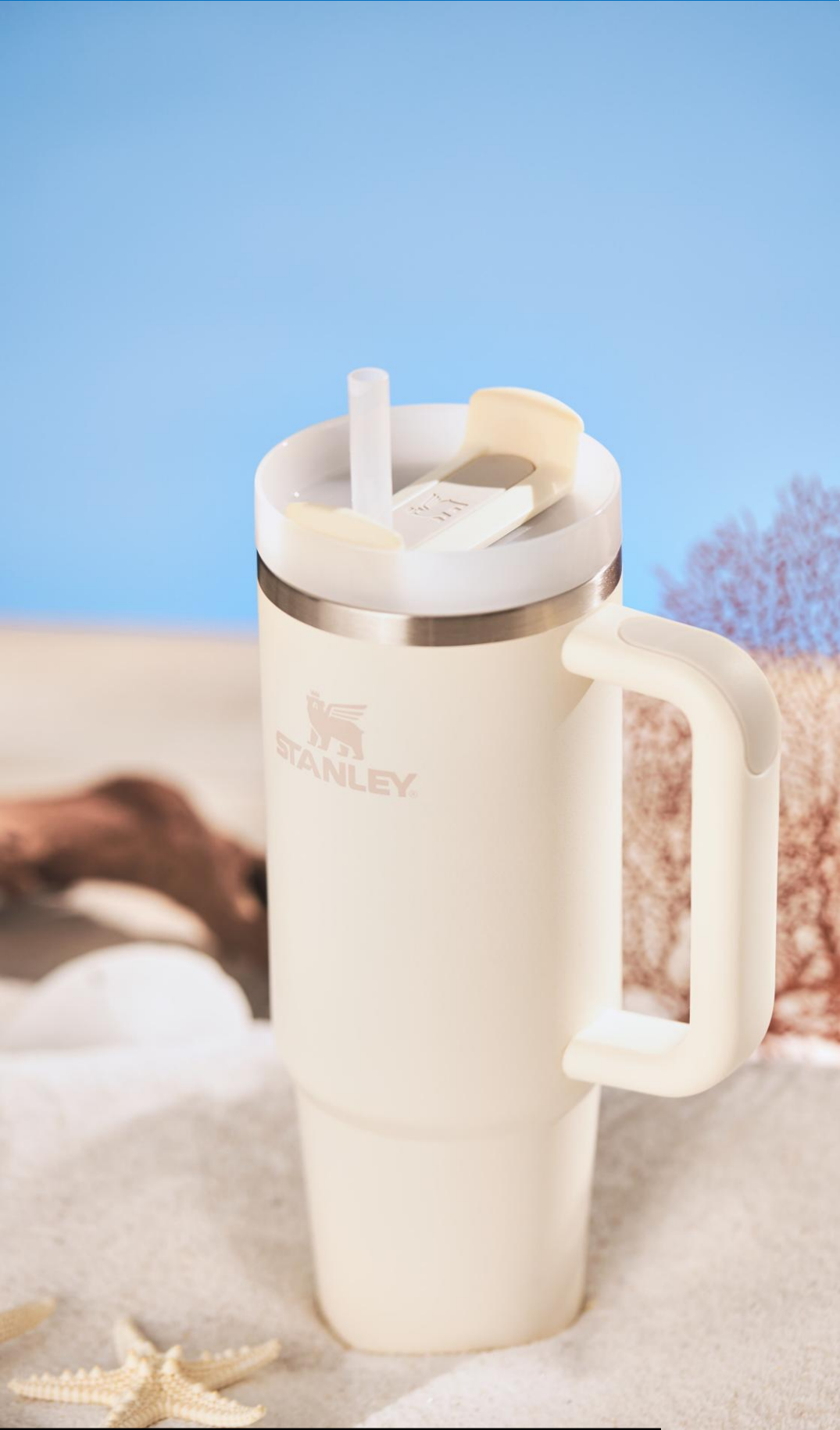
1603-01 Stanley Quencher H2.O FlowState 40oz Tumbler $50.00e