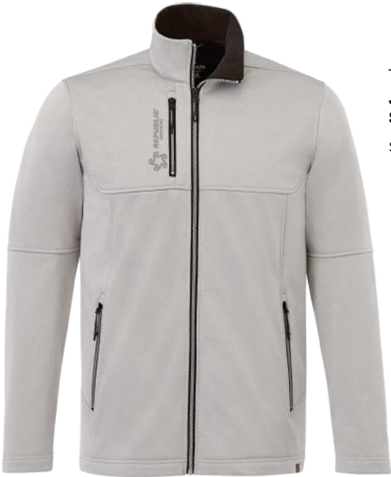
TM12940 / TM92940 Joris Eco Waterproof Softshell Jacket $74.67c