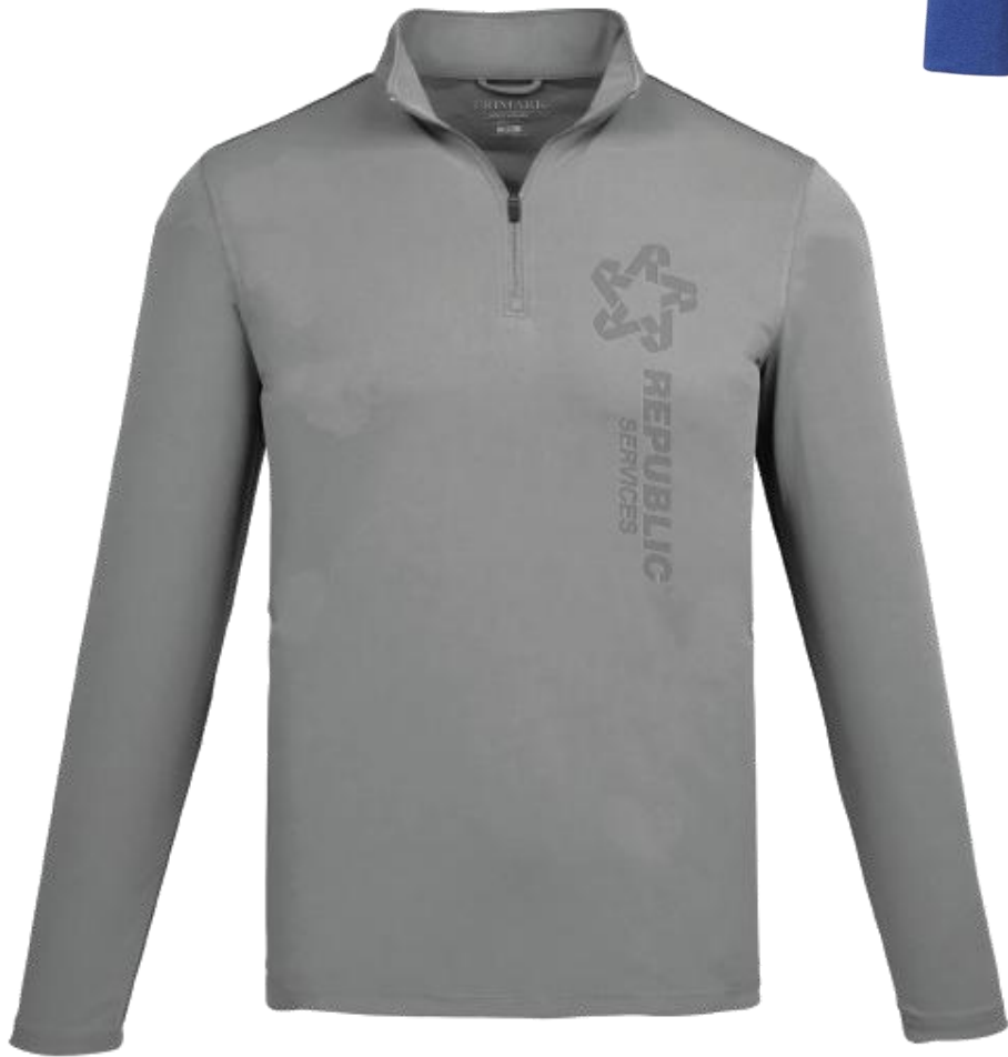
TM18176 / TM98176 Dara Recycled Tech Quarter Zip $32.00c