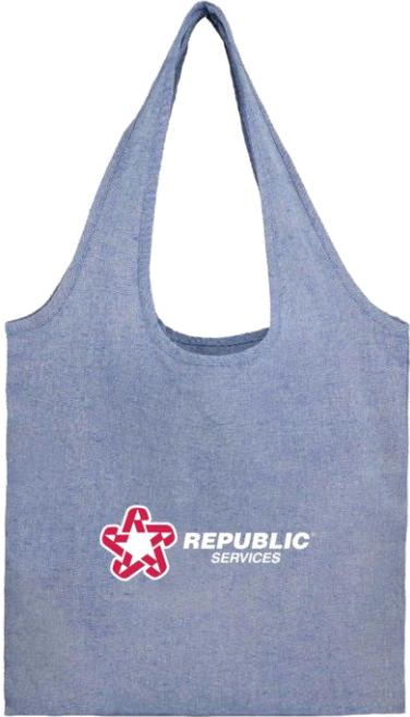
SM-5234 Bungalow 5oz Recycled Cotton Twill Shopper Tote $2.98c