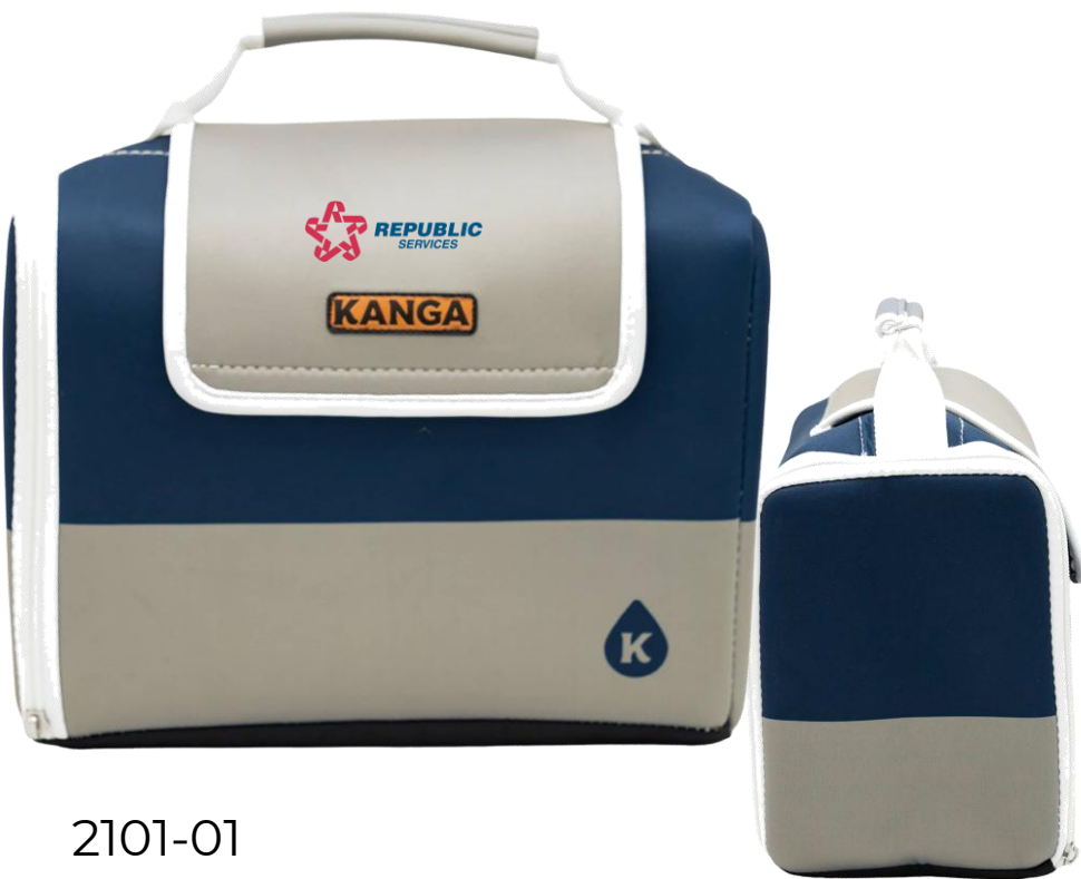
2101-01 Kanga Kase Mate 12-Pack Cooler