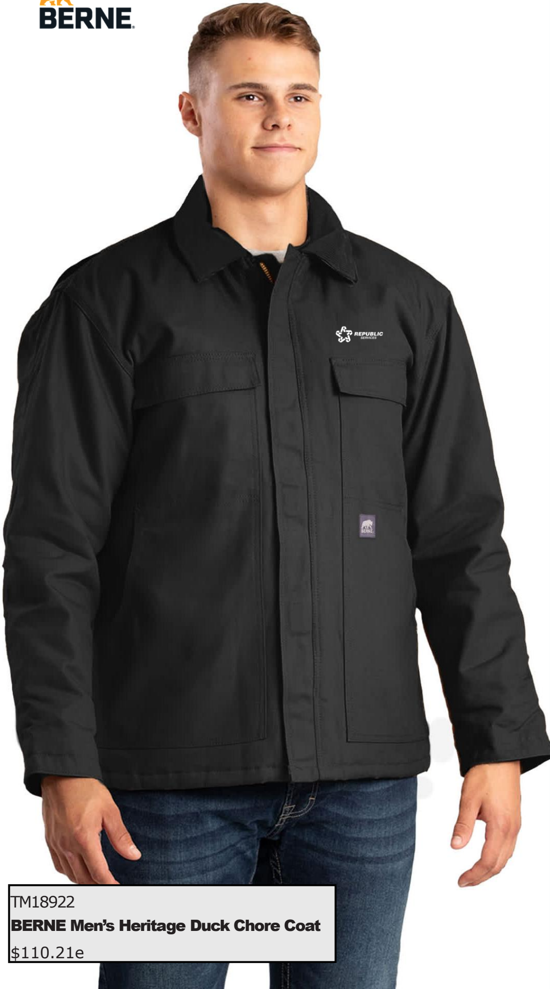
TM18922 BERNE Men's Heritage Duck Chore Coat $110.21e