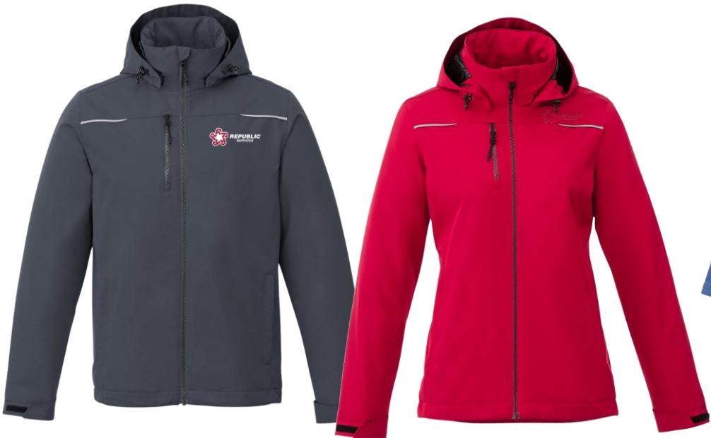
TM19101 / TM99101 Colton Fleeced Lined Waterproof Jacket