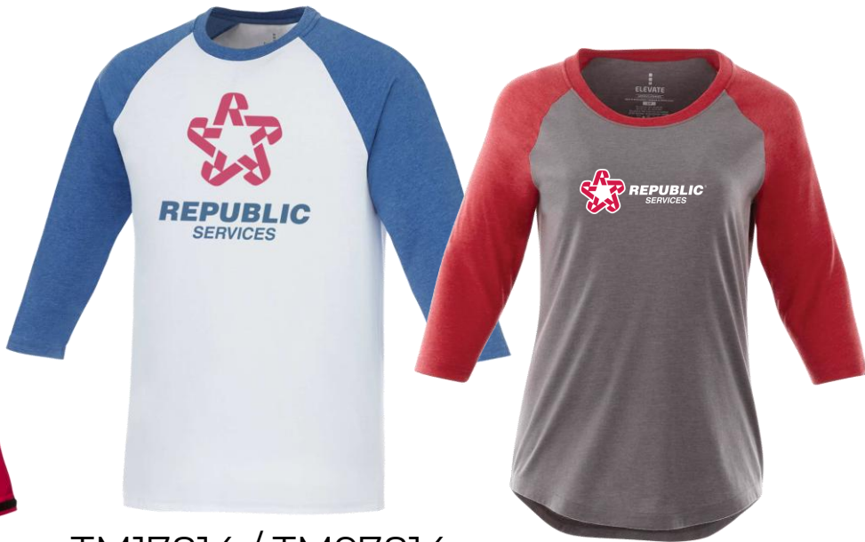
TM17814 / TM97814 Dakota Three Quarter Reglan Tee