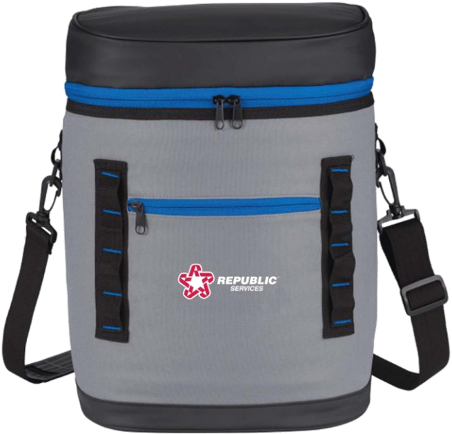
4200-21 Premium 20 Can Backpack Cooler $29.98c