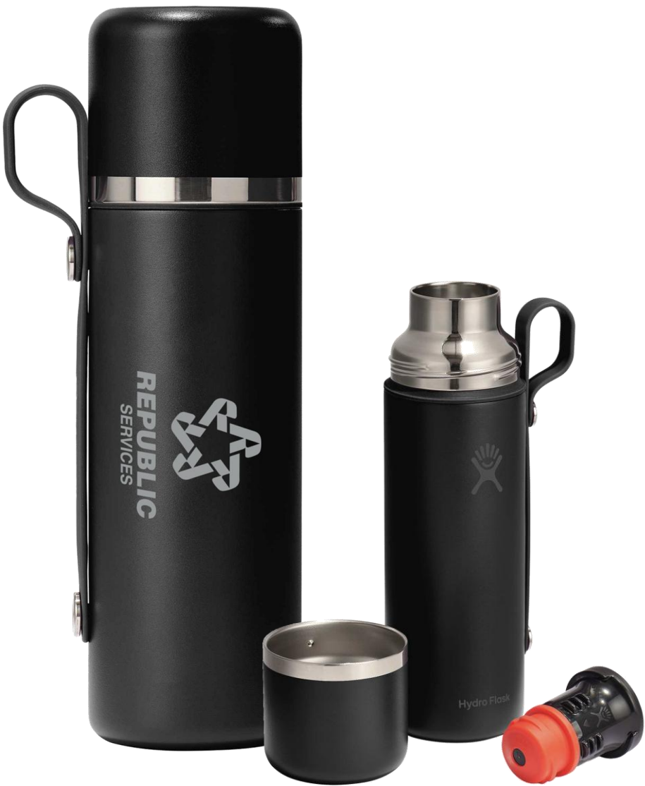
1601-86 Hydro Flask® 28 oz Hot Flask & Cup $59.96e