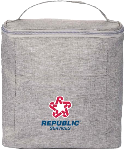
SM-5723 Double Lined 9 Can Cooler w/ Easy Clean Liner $12.49