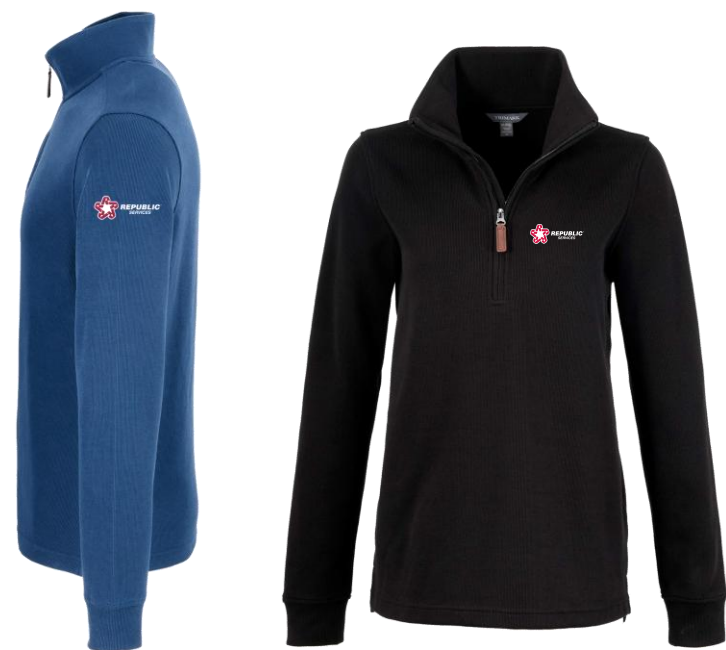
TM18312 / TM98312 Hudson Eco Knit Ribbed Quarter and Half Zip