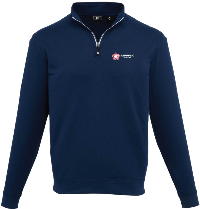
TM18179 FootJoy Approach Performance Quarter Zip $135.63d