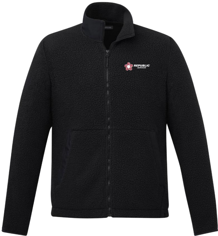
TM18143 / TM98143 Kahuzi Eco Full Zip Sherpa Jacket $45.25c