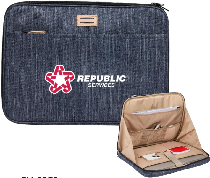
SM-8250 The Goods Navy Heather Recycled Mobile Office $20.98c