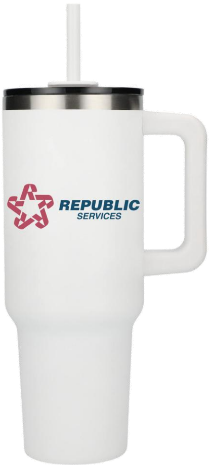
1603-15 Pinnacle 40oz Vacuum Eco Straw Tumbler $16.98c