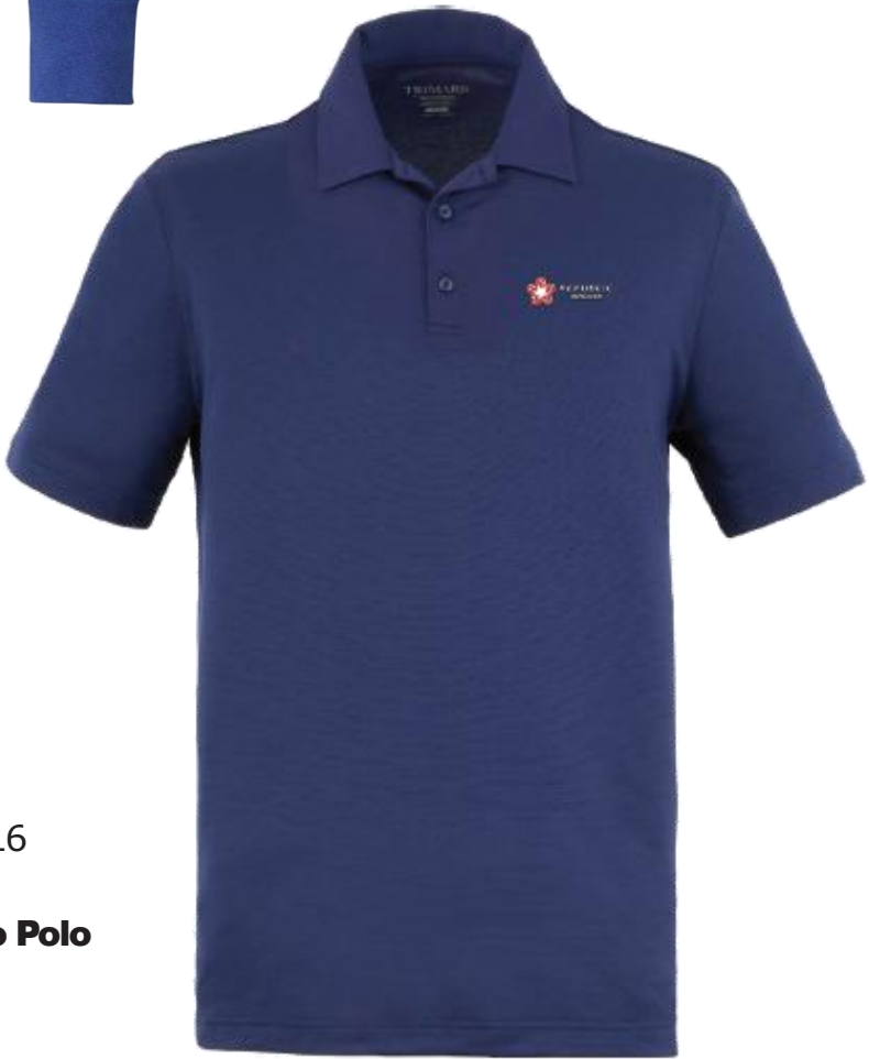
TM16316 / TM96316 Izu Everything Performance Eco Polo $33.42c