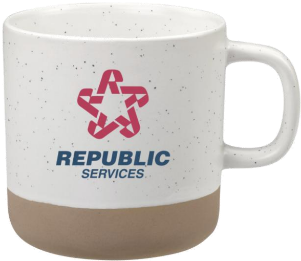
SM-6355 Santos Artisanal 12oz Ceramic Coffee Mug $4.92c