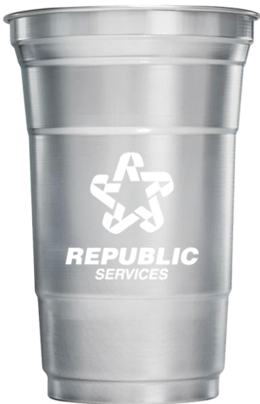
SM-6547 Top Cup by Ball™ 20 oz Aluminum Cup