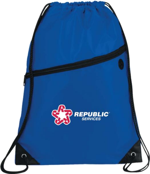
SM-7353 Robin Drawstring Polyester Bag w/ Zipper Front Pocket $2.50c